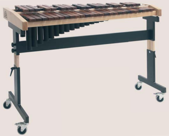
XCWP 40 62985 XCWHR 40 62987 4 oct. c 1 – c 5 , Padouk bars 4 oct. c 1 – c 5 , Honduras rosewood bars 40 x 22 mm, A = 442 Hz. Mobile stand, Length 158 cm. Low end 69 cm. High end 27 cm. Height adjustable 85 – 95 cm.