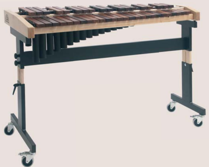
XCWQHR 40 62992 4 oct. c 1 – c 5 , Honduras rosewood bars 45/40 x 22 mm, Quint tuned, A = 442 Hz. Mobile stand, Length 161 cm. Low end 69 cm. High end 27 cm. Height adjustable 85 – 95 cm.