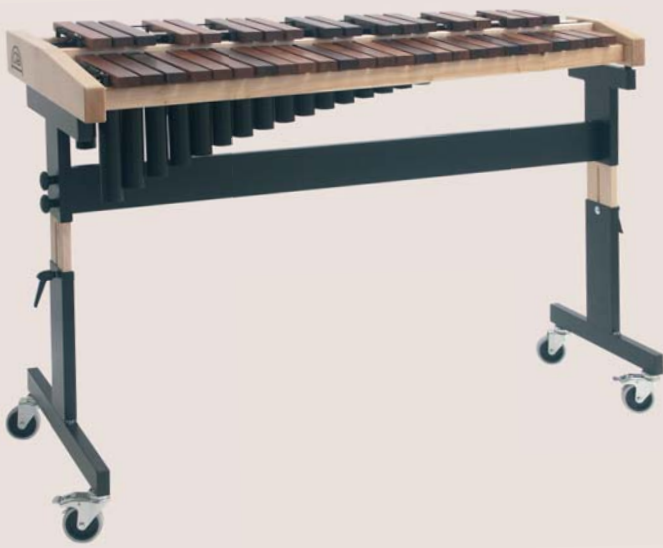
XCWP 35 62980 XCWHR 35 62982 3 1/2 oct. f 1 – c 5 , Padouk bars 3 1/2 oct. f 1 – c 5 , Honduras rosewood bars 40 x 22 mm, A = 442 Hz. Mobile stand, Length 143 cm. Low end 65 cm. High end 27 cm. Height adjustable 85 – 95 cm.