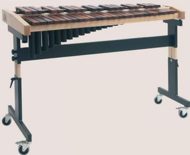
XCWHR 40 62990 4 oct. c 1 – c 5 , Honduras rosewood bars 45/40 x 22 mm, A = 442 Hz. Mobile stand, Length 161 cm. Low end 69 cm. High end 27 cm. Height adjustable 85 – 95 cm.